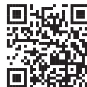
On behalf of IMPACT (Young People's Forum for SEND)