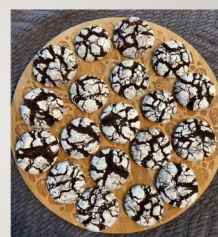
Ava - Year 7