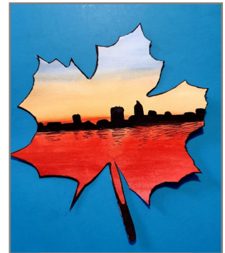
By Dharma Year 10